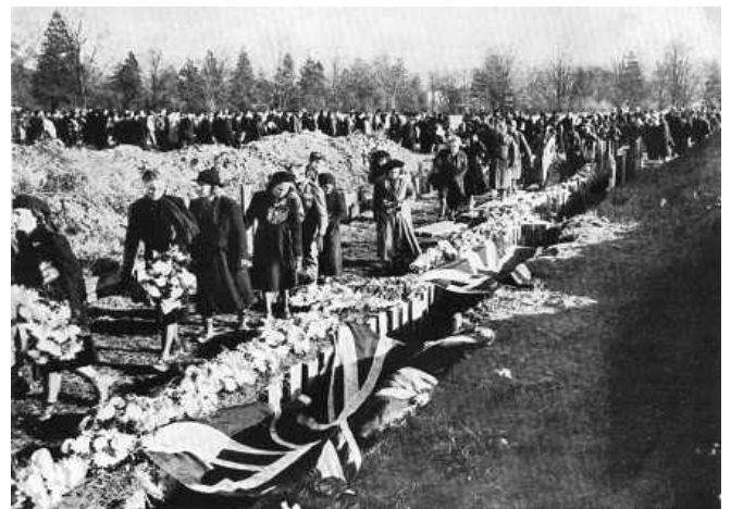
Mass Grave in London Road Cemetery