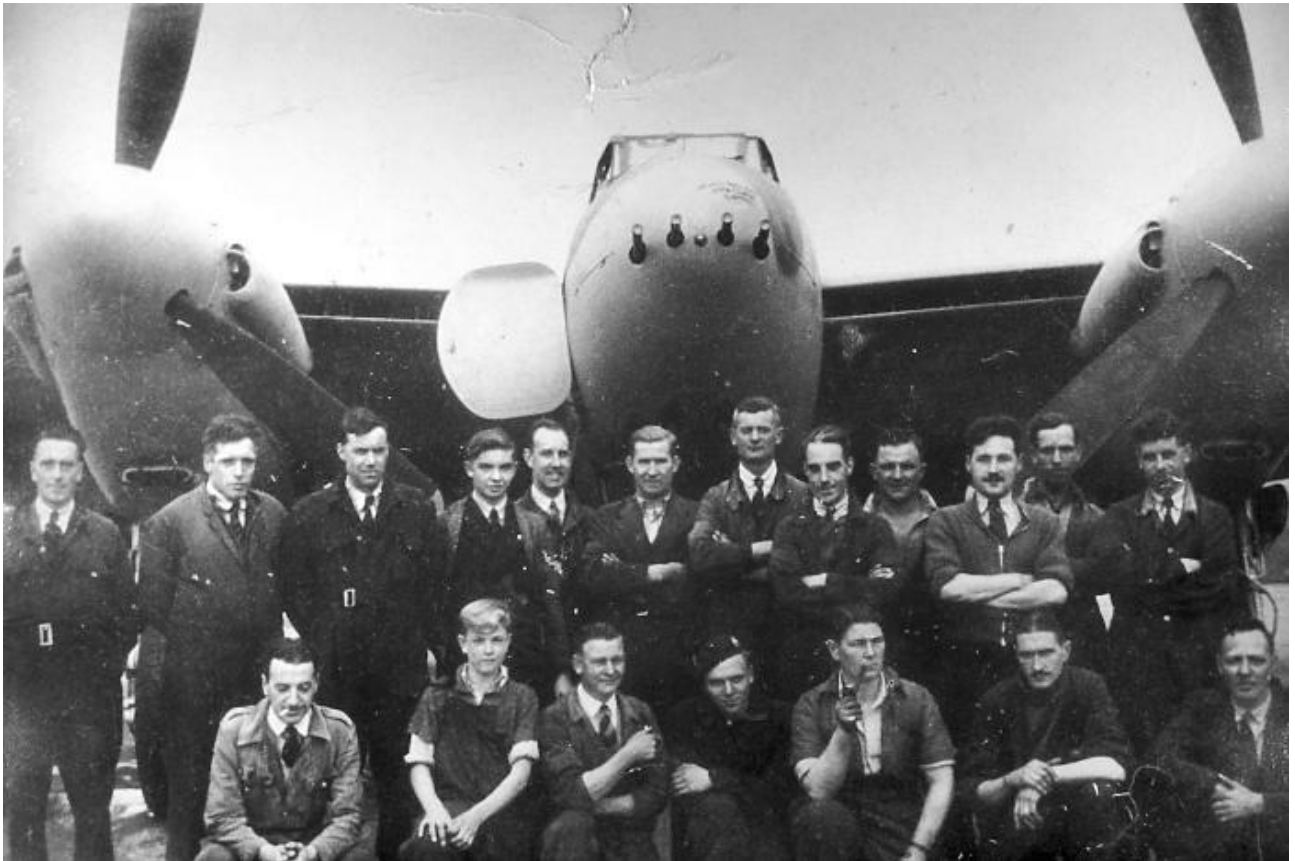
De Havilland Mosquito Assembly – Coventry