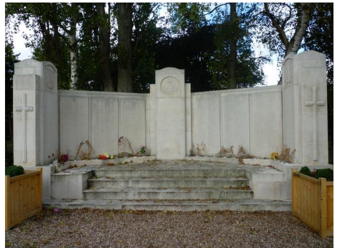
The Civilian Monument at London Road, Cemetery